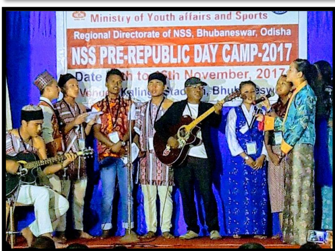
Page | 13