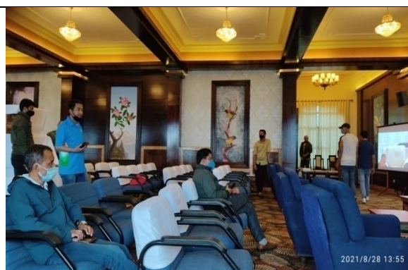
Preparation at Samman Bhawan on 28.08.2021