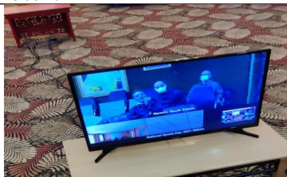
Testing for Webcast at NIC Namchi