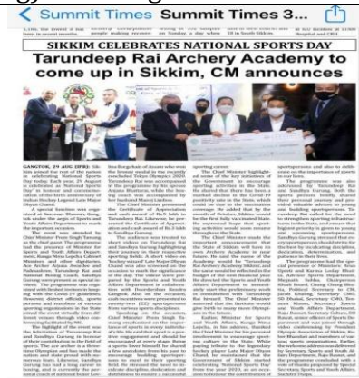
Local news paper cutting