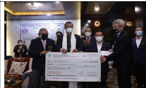
Shri Tarundeep Rai (Olympian) receiving cash award of Rs. 5 Lakh from HCM