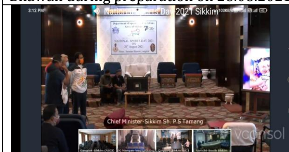
Final Testing for Webcast from four District NIC Centres