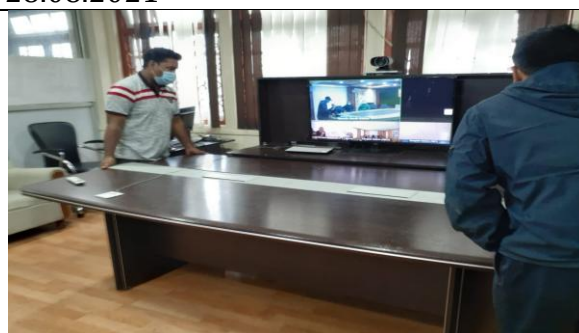
Preparation at NIC Gyalshing on 28.08.2021