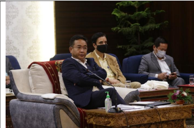
Hon'ble Chief Minister Shri P. S. Tamang with Cabinet Ministers